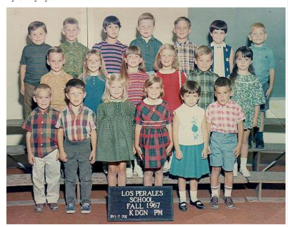
The author of this article, pictured above with classmates in 1967, was a student at Los Perales School in Moraga. The school opened in 1965, but due to declining enrollments closed its doors in 1983; it re-opened in 1997 after a bond was passed to reopen it.

used to be? The crush of kids on changes and to ensure the accuracy minimum days buying snacks is a of near term projections at least every tipoff – along with traffic heading to two years," the report cautioned. schools – that young families are certainly drawn to Lamorinda's green the near future, but as of today, only hills and great schools, and as exist- the Marquis Townhomes project at ing homes gradually turn over, and new developments in various stages of completion open, it's expected that school enrollments will continue to rise, which is causing some concern among long-term residents.